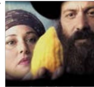
Movie Night: Ushpizim