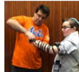
FJMC World Wide Wrap