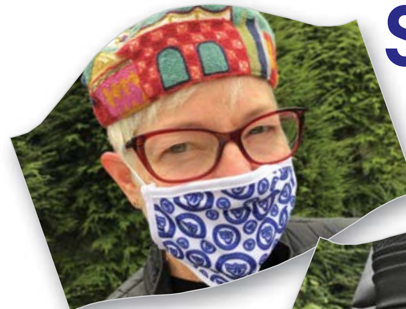
▲ Blue logo with white background