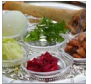
First Night of Pesach