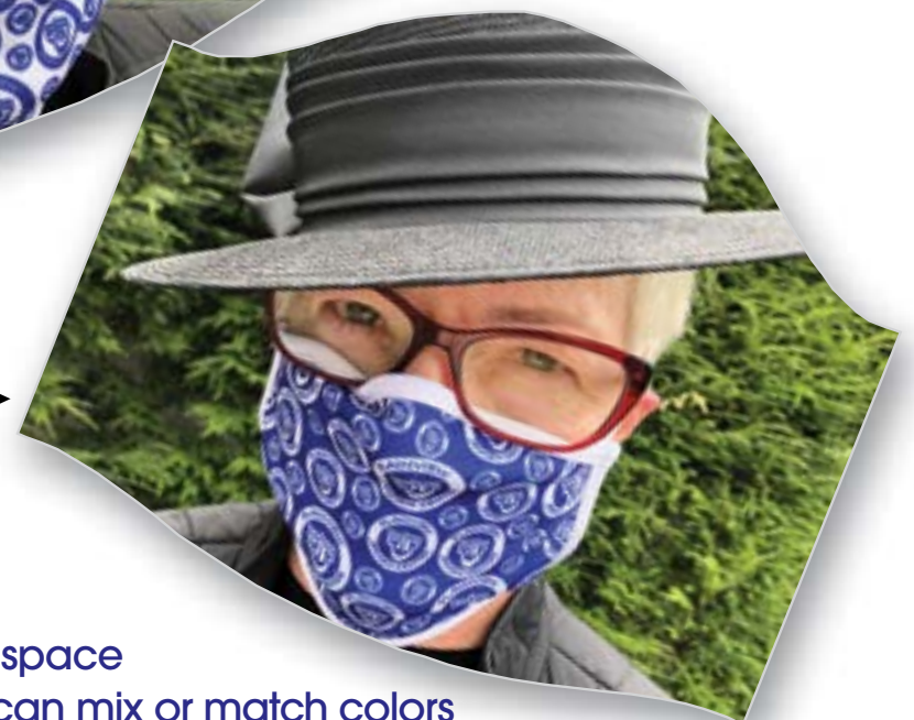
▶ White logo with blue background