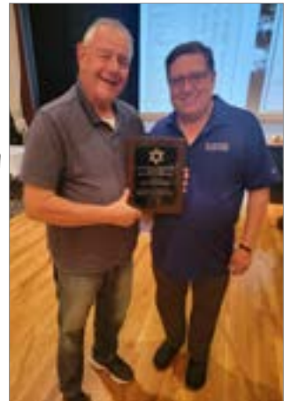
Member Appreciation Dinner