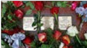
Holocaust Reparations Presentation